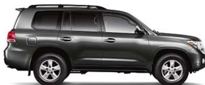
MAGNETIC GRAY METALLIC Dark Gray interior