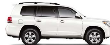
SUPER WHITE Dark Gray or Sand Beige interior