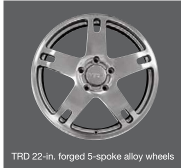
TRD 22-in. forged 5-spoke alloy wheels