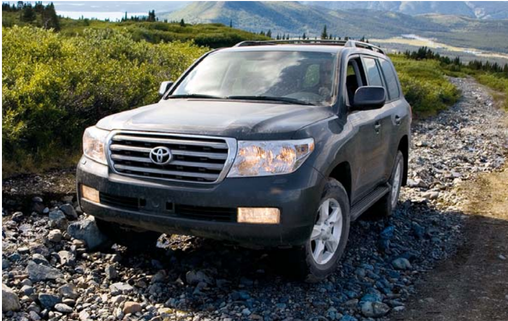
Land Cruiser shown in Magnetic Gray Metallic with available Upgrade Package.