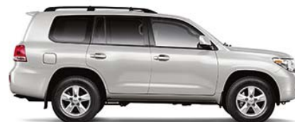
CLASSIC SILVER METALLIC Dark Gray interior