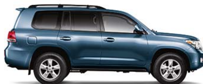
PACIFIC BLUE METALLIC Dark Gray or Sand Beige interior