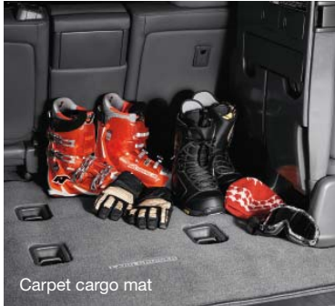
Carpet cargo mat

Genuine Toyota accessories are one good way. They're built to the same exacting standards as the Land Cruiser itself. Even if you don't customize it, though, odds are it will end up feeling like it's yours. After the first few hundred thousand miles or so. Some accessories may not be available in all regions of the country. See your Toyota dealer for details.