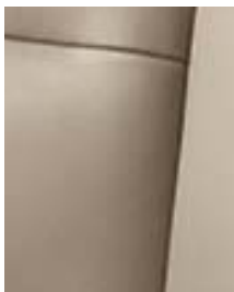
Leather in Sand Beige