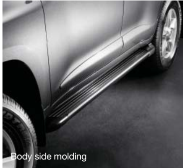
Body side molding