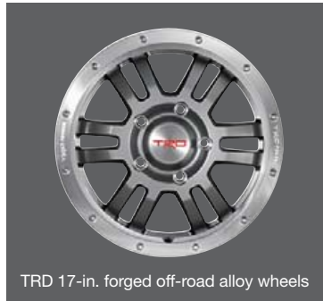
TRD 17-in. forged off-road alloy wheels

All-weather cargo mat Body side moldings Cargo net Cargo tote Carpet cargo mat Carpet floor mats 26 Emergency assistance kit First aid kit Hood protector Paint protection film Remote Engine Starter