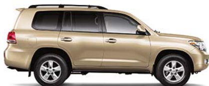
SONORA GOLD PEARL Sand Beige interior