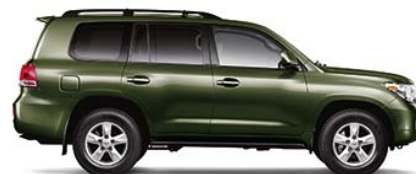
AMAZON GREEN METALLIC Dark Gray or Sand Beige interior