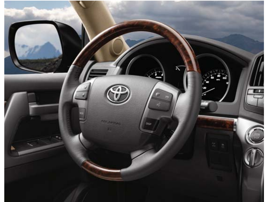
Land Cruiser interior shown in Sand Beige with available Upgrade Package.

Since 1951, Land Cruiser has taken people to the ends of the earth and back. Today, the 4WD Land Cruiser combines legendary off-road prowess and a powerful 5.7L V8 with an 8-passenger interior of unparalleled refinement. When you think about it, luxury and rugged capability are a perfect combination. After all, you can take the man out of civilization, but you can't take the civilization out of the man. The 2011 Toyota Land Cruiser. Moving Forward.