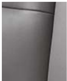
Leather in Dark Gray