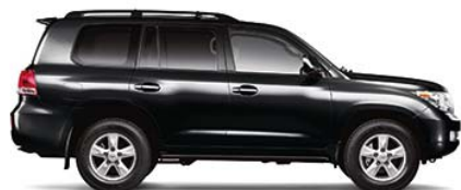
BLACK Dark Gray or Sand Beige interior

Land Cruiser is available in eight exterior colors and two interior colors. But remember, this is one of the world's most legendary off-road vehicles. Which means Land Cruiser also offers a nice dust color, if that's what you're looking for.