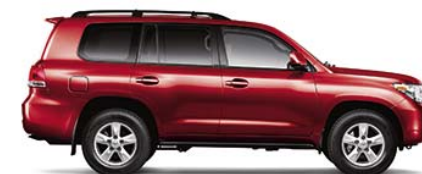
SALSA RED PEARL Dark Gray or Sand Beige interior